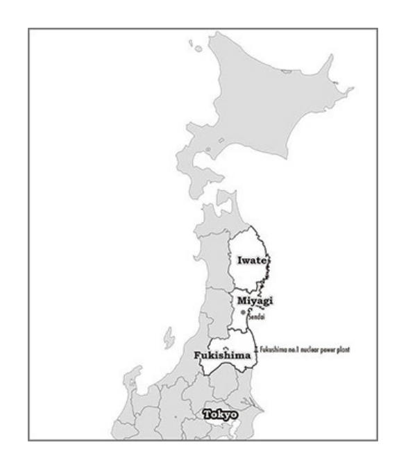
Figure 3: The Three Prefectures Most Affected by the 11 March 2011 Tsunami

** The one female interviewee at Miyagi had moved to another place. Table 1: The Interviewees