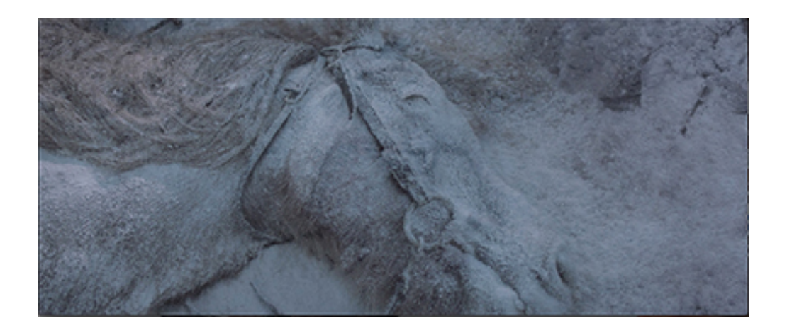
Death of Old Piebald [Still from Of Horses and Men.]