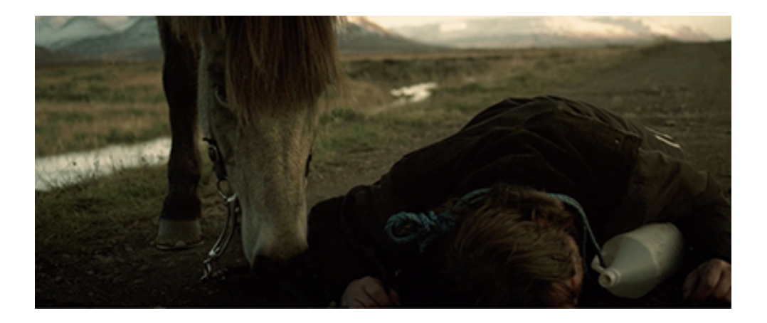
Jarpur and Vernhardur [still from Of Horses and Men]

The horses who watch seem to animate the relationship between the farmer and the widow, for the farmer and the widow finally find love in their animal irresponsibility, in a meadow, surrounded by horses, tethered to nature as represented by the gelding.