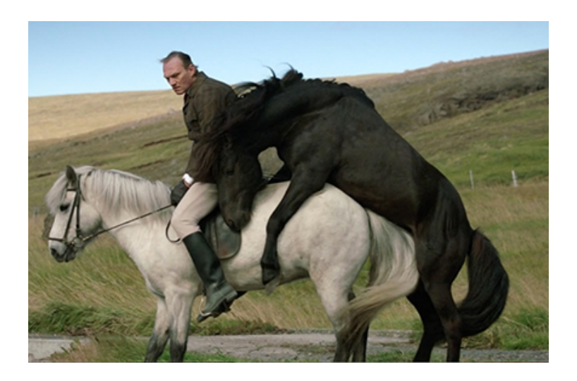
"Brunn mounting Grana" [still from Of Horses and Men]