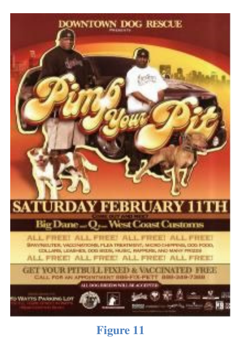
gang violence, this event, and events since then, have all gone off without incident, thanks to Lori's street connections who help provide security and "put the word out" that these events are special.

The first major event she put together was "Pimp Your Pit" in 2006 (see Figure 11). With funding from a variety of sources and the City of Los Angeles's mobile spay/neuter program, she was able to bring together a temporary community of people who owned pitbulls and other big breeds. While the city itself and many local animal advocacy groups were worried about