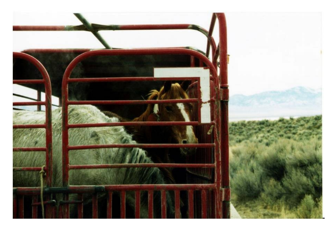
Figure 3: Mustang as Pest

becomes an image used not only by those who claim it as a national symbol, but also by those who see it as part of their unique local culture. For those who do not live in close proximity to a range, where they think a mustang lives and where it actually lives are not the same thing. What makes a mustang beautiful in the abstract is its association with the uncivilized or the "natural." At a Tourism Summit in Utah, it was stated, "People from the East Coast have no frame of reference for how big our state is and the farther away they come from, the wilder they want it...wild rivers, wild horses, wild Indians (Benson). Belief in a place where nature determines survival intertwines itself with a laissez-faire management style that could potentially contribute to the starvation of thousands of animals. At the local level, creating mustangs that are visually pleasing to tourists could lead to deformities and potentially harm the viability of the herds. Assuring that mustangs will endure requires recognition that beliefs and imagery impact management decisions at every level. The image of the beautiful mustang is not is not used for a single ideological agenda, but is one that can be mobilized to argue a number of positions. It is less about the animal and more about human desires. The same can be said when viewing a mustang as a pest.